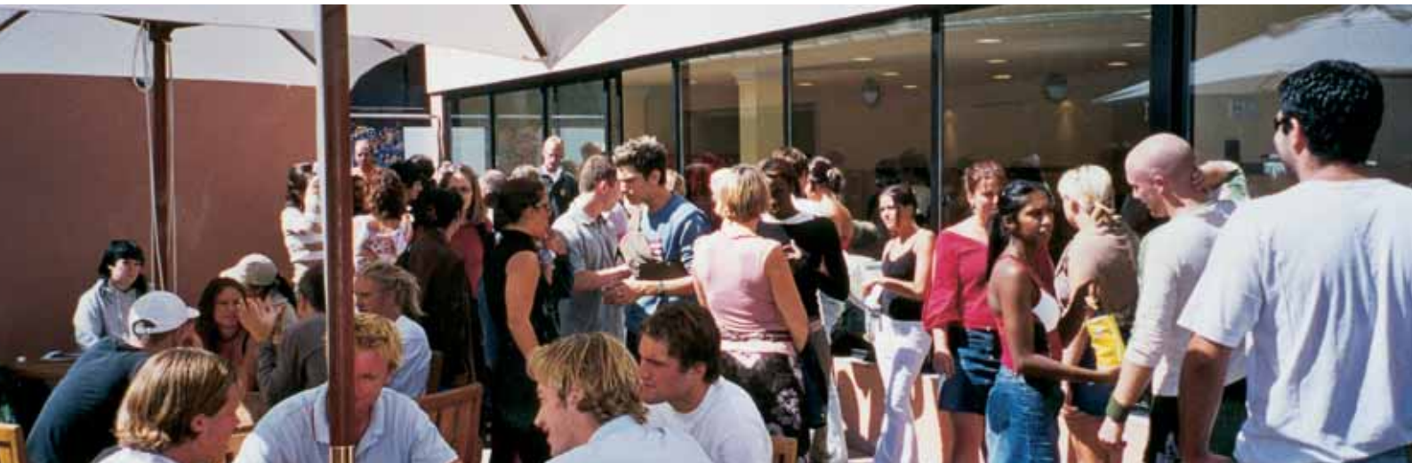
Break time on the school terrace