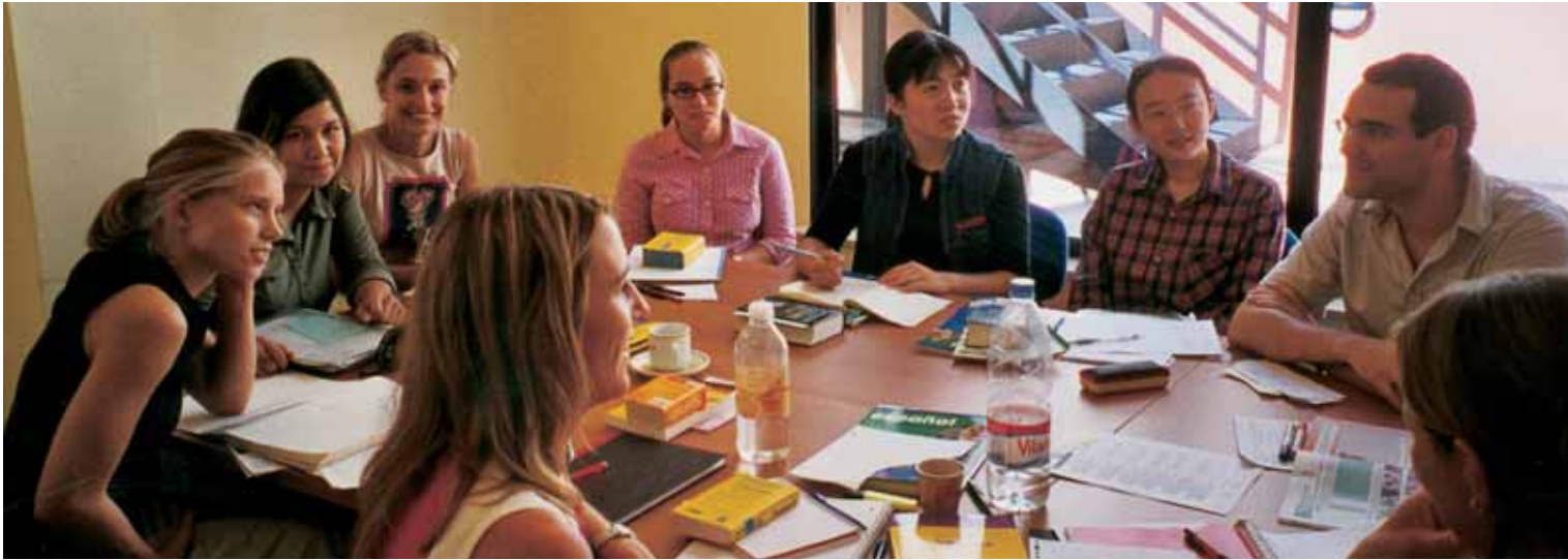
A Spanish lesson