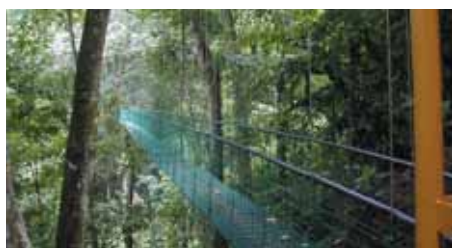
Forest canopy 'Sky-walk'

San Joaquín de Flores is a prosperous, friendly, middle-class town of around 5,000 people, 17km from San José . Here in a small town, it is easy to meet 'Ticos' (Costa Ricans).