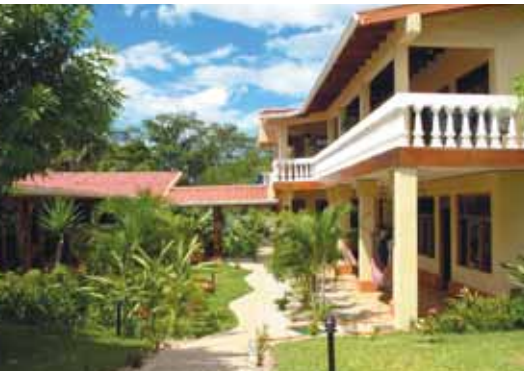
The school - Flamingo Beach

Flamingo Beach , with its ivory-white sands and crystal clear waters , is one of the most spectacular beaches in Guanacaste, a province famous for its unspoilt coastline , turtles, reefs, volcanoes, snorkelling and surfing . The climate is hot and sunny throughout most of the year, and drier than most of Costa Rica, with occasional rainy days limited to September-October. The area is completely untouched by mass tourism, unspoilt , waiting to be discovered.