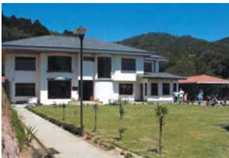
The school - Monteverde

Our school in Monteverde has 17 classrooms, video room, cafeteria, computer room and gardens. A wide range of visits and excursions are offered, from forest canopy 'sky walks' to Arenal volcano trips. Courses can be combined with Flamingo Beach and San Joaquín de Flores.