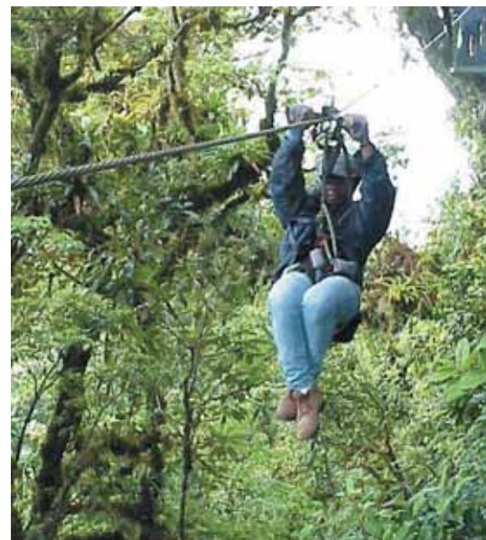
Through the forest canopy