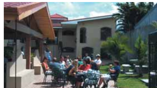
School buildings - San Joaquín