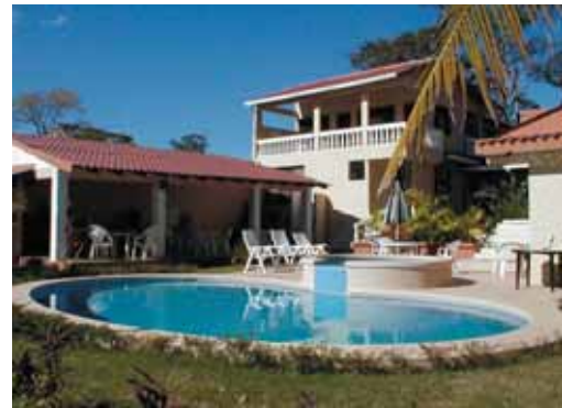
On-site pool at the school, Flamingo Beach

Our school is just 5 minutes walk from the beach . There are 16 air-conditioned classrooms, study/Internet room, cafeteria + on-site swimming pool . Students are accommodated in host families in the nearby villages of Potrero + Brasillito, or in studio apartments, or in hotel (with pool) if preferred. A free shuttle bus operates between accommodation + school in the morning/ afternoon. The school organises a wide range of optional extra activities - Salsa dancing lessons, beach barbecues, horse-back riding , cookery lessons, sailing trips, surfing trips, rain forest excursions , to mention but a few! Volunteer work is also available during or after the course.