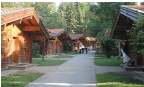
Student log cabin accommodation