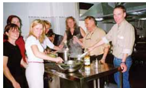
Greek cookery lesson