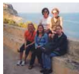
School in Athens