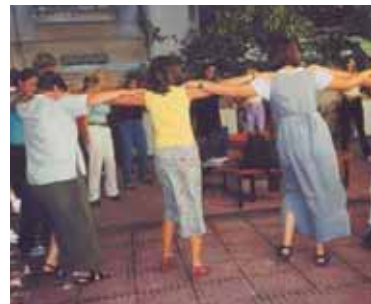
Greek dance lesson

Greece is a country famous for its history, culture, climate, wonderful scenery and friendly locals. Enjoy re-discovering this ancient culture and modern-day people through learning the beautiful language of this magical country.