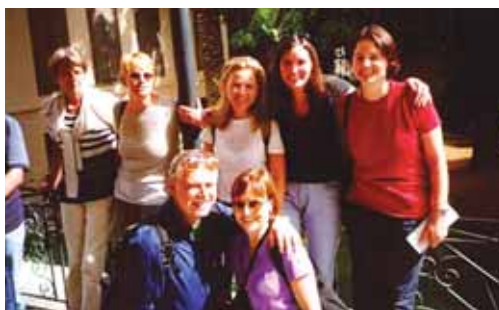
Making friends on the course