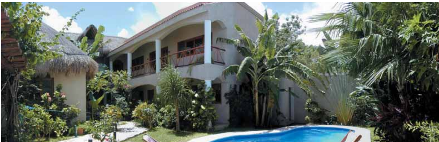
The school, on site residence and pool