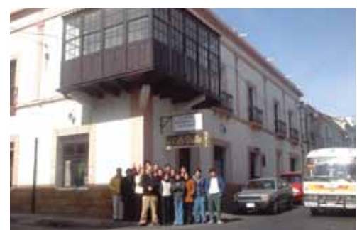
The School, in the centre of Sucre