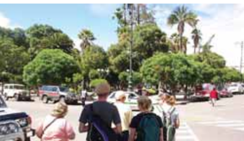
The Main Square