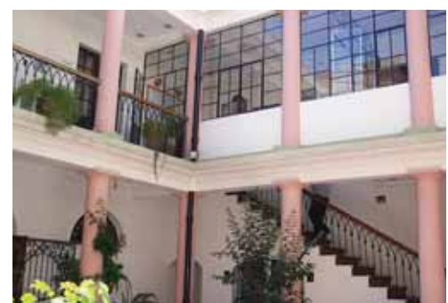
The School Patio