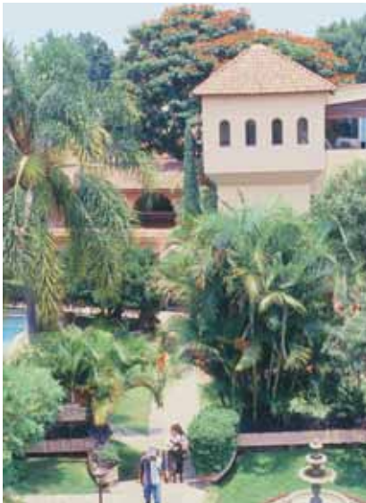
Campus with on-site pool