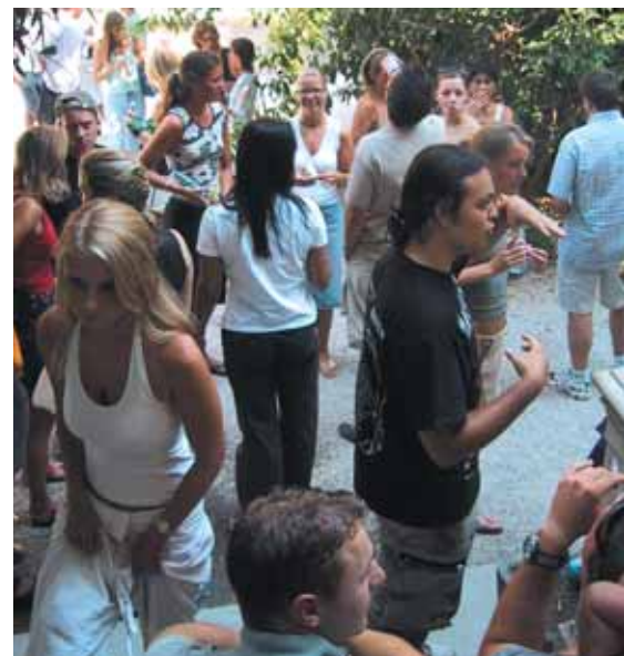
Break-time, school patio