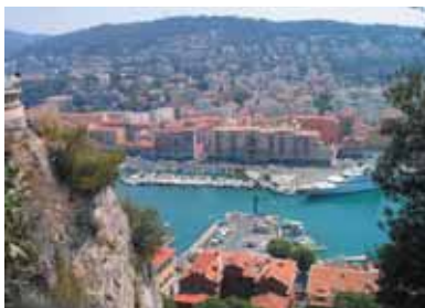
The Harbour - Nice