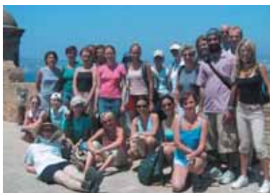
Excursion to Cannes